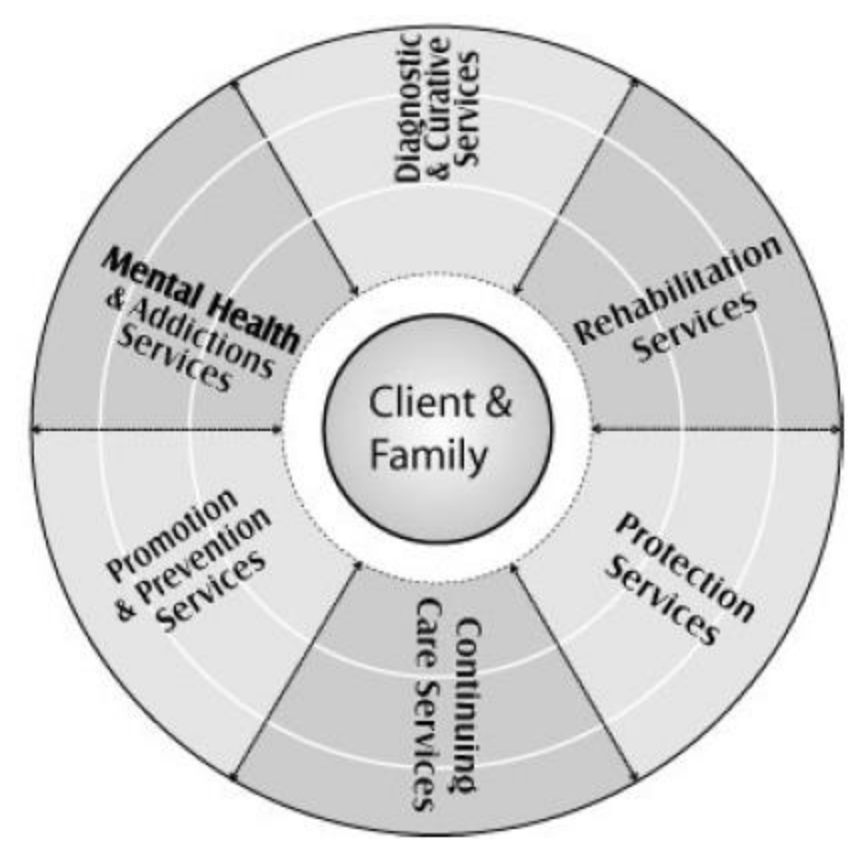
Figure 3: Integrated Services Delivery Model.